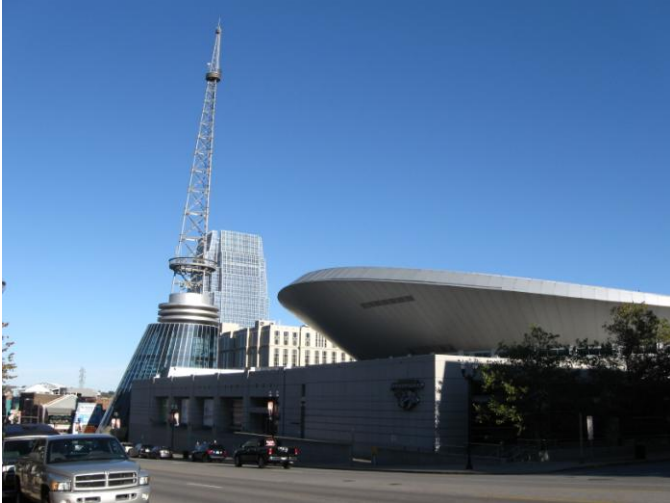
This is a shot of the Sommet Center and the Visitor Tower next to it.