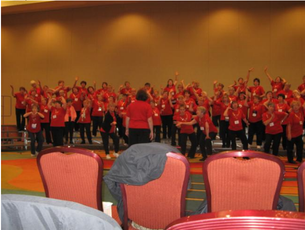
Picture of us during one of our intense rehearsals.

Wednesday it was down to business, being thrown into the busyness of the convention and the worry over competing with all of the "big girls". We had two power rehearsals to refine and 'cement' all that we learned up to that point. In between rehearsals we had fun watching the quartets from Region 6 compete.